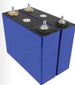
Lifepo4 battery 3.2V 304A