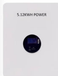
Solar LiFePO4 B5.12KW 51.2V 100Ah 200Ah atttery