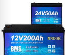
12V & 24V SERIES ENERGY STORAGE LITHIUM BATTERY