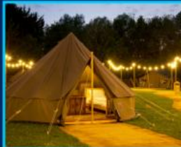
Household energy storage