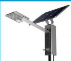
Solar Street Lighth