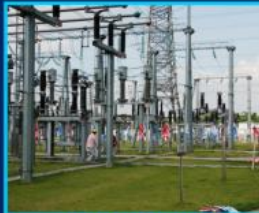
Power Station energy storage